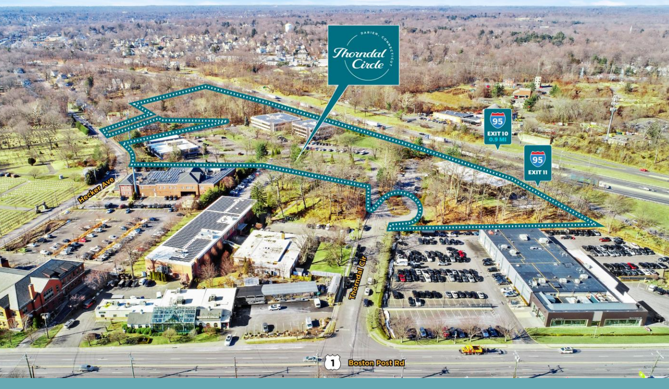
11.8-Acre Downtown Darien Redevelopment Opportunity